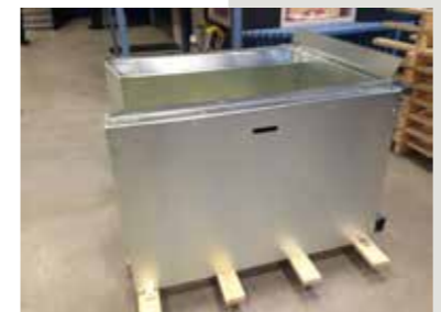
Galvanised or stainless-steel versions also available. Ask the quotation separately.