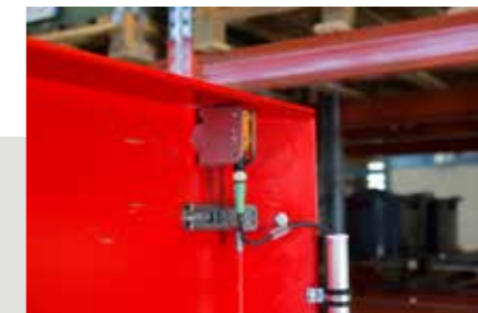
Overfilling sensor for M and L units fitted onto the safety wall extension