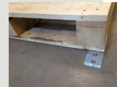
Floor mounted stopper plates for handling CHEP-pallets.