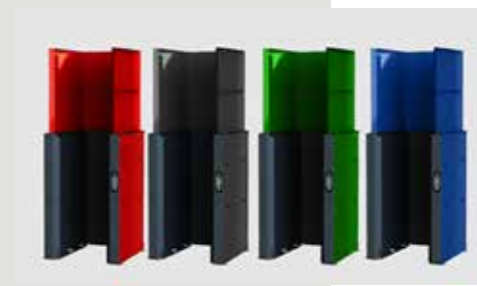
Standard paintings for side panels and safety extension are RAL 3020 and 7035. Basic machine is as standard RAL 7024.