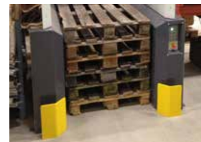
Forklift protection barrier. 1 set incl. bolts