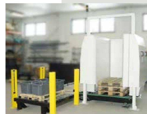
Models for system integrators are also available