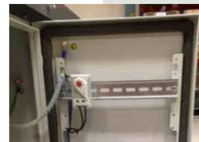
Cold temperature package for installation into the cold warehouses or loading platforms etc. down to -25°C. Available for electric machines. Includes heating element and thermostat inside the electric cabinet.